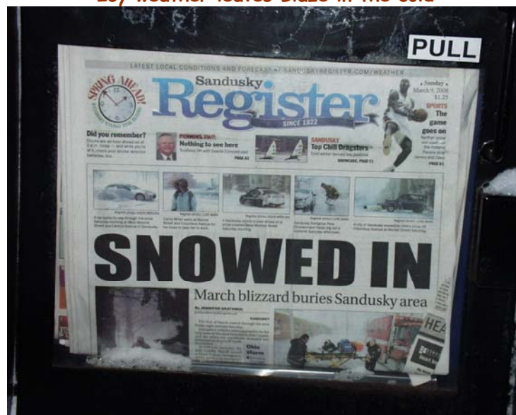
Sunday headlines tell it all