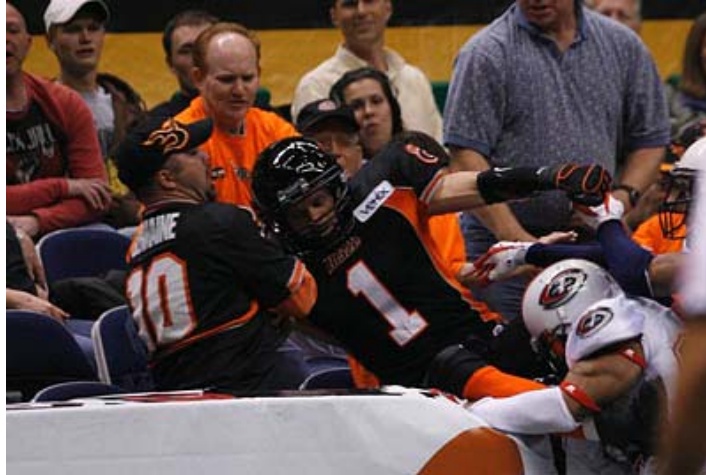
AirBoone flies into the crowd after nabbing a first down catch