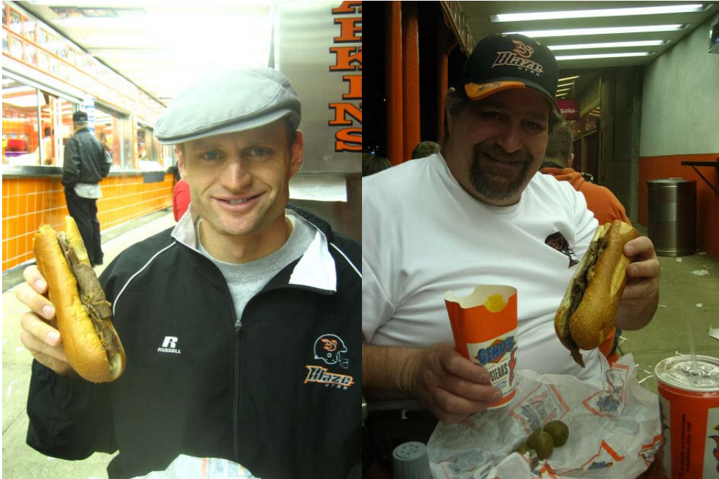
AirBoone and Sumoflam with their steak sandwiches